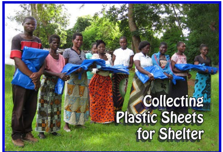
Collecting Plastic Sheets for Shelter