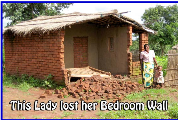
This Lady lost her Bedroom Wall