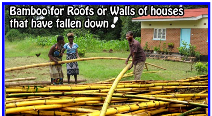
Bamboo for Roofs or Walls of houses that have fallen down!