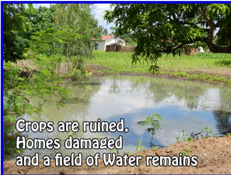
Crops are ruined, Homes damaged and a field of Water remains